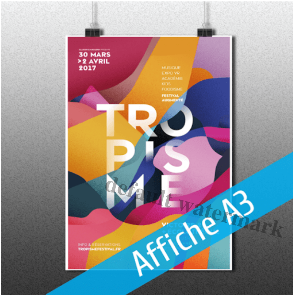
Affiche Publicitaire Recto A3 59,4 x 29,7cm