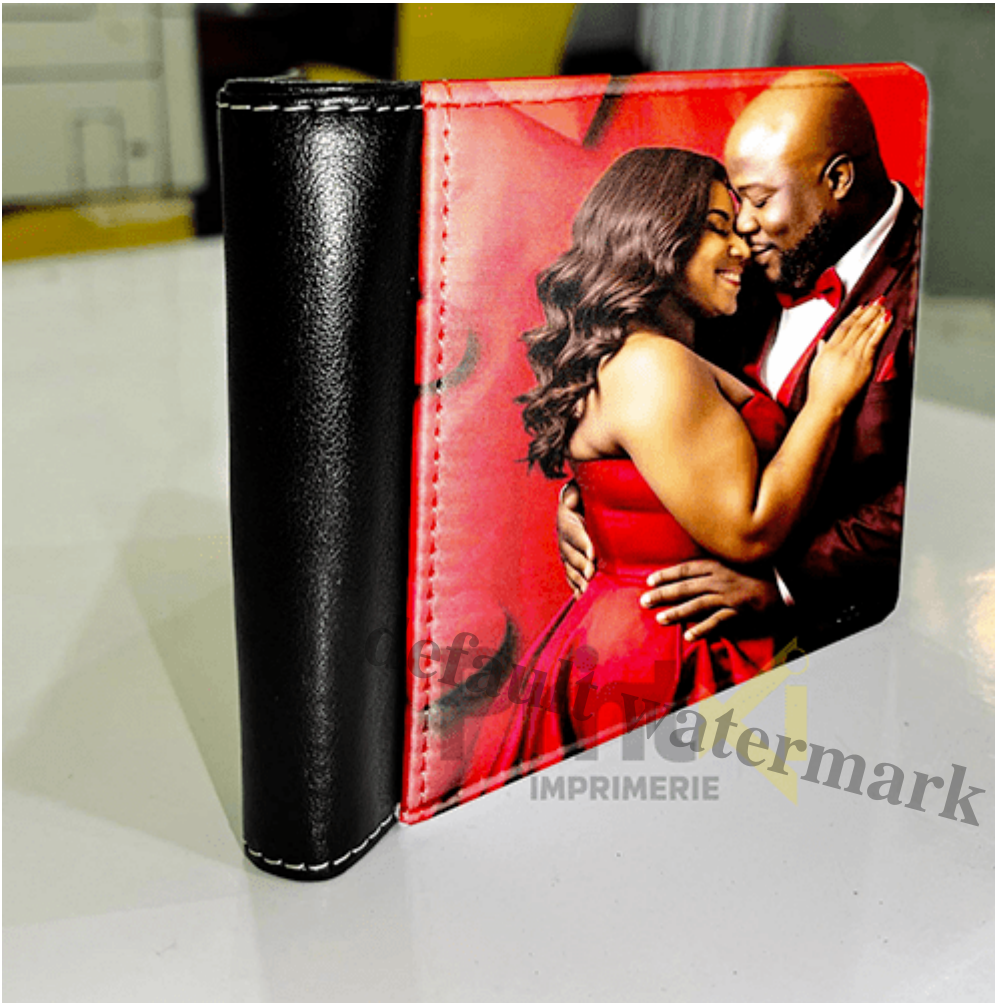
Portefeuille St Valentin